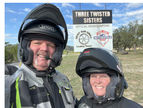
Bent Rim Grill

As we rode through Leakey, we noticed several people setting up tables along the road to sell souvenirs and food. Looked like they were expecting a big crowd. I'm sure they were disappointed since we didn't see crowds of any size.