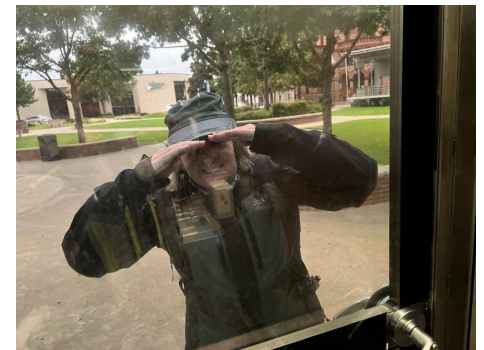
Can See Out, Not In

The square in Sulphur Springs was very nice, besides the unique restrooms, there was an awesome Veterans Memorial with an eternal flame. The courthouse was beautiful!