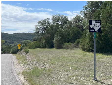
Ranch Road 335

15 minutes after the viewing, I pinged Spotwalla as required per the IBA ride rules. Now, it was time to finish the 3 Twisted Sisters! We had already ridden more than half of RR 337. From here, we headed up RR 336, then over to RR 335 that would take us back to RR 337 where we returned to the Bent Rim Grill completing the 100-mile loop.