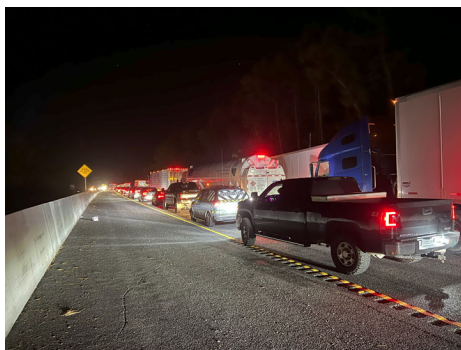
Accident on I-12

It was 11:30 pm by now. Shortly after we stopped, we could see a helicopter circling above. Emergency vehicles used both shoulders to make their way past us to the accident. We waited!