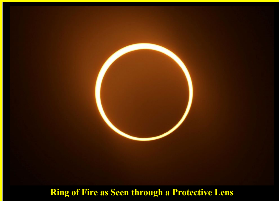
Ring of Fire as Seen through a Protective Lens

Iron Butt Association (IBA) Requirements: Solar Eclipse 1000 Gold - ride at least 300 miles to your eclipse viewing location which MUST be within the path of the eclipse and view the eclipse at the time of the 'maximum view' of the eclipse for that location - 24 hours