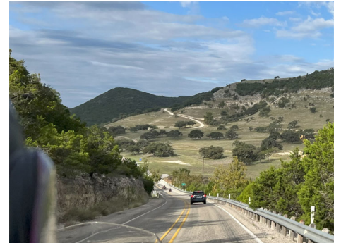
Texas Hill Country

It took us about 2 hours to complete the loop. Like the eclipse, I was impressed with the Three Sisters—more than I thought I would be! I'm so glad we included it into this Iron Butt challenge!