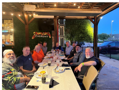
Eclipse Pre-Ride Dinner

We ate dinner with 10 other long-distance riders. They came from Wisconsin, Indiana, Missouri, Arkansas, Tennessee, and Mississippi to see the eclipse in the maximum viewing path that angled across Texas.